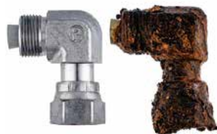
ToughShield Plus (left) and Zinc-crimped (right) swivel adapters after 3,000 hours SST

The superior corrosion resistance of Parker's latest plating technology is validated through ASTM B117 / ISO 9227 neutral Salt Spray Testing (SST), as well as two Cyclical Corrosion Tests (CCT) - ISO 16701 and SAE J2334. CCT is widely considered to provide a closer correlation to field corrosion conditions. ToughShield Plus is the first standard plating system in the fluid power industry proven to offer this exceptional level of resistance to red rust. Download our whitepaper on www.toughshield.com to learn more.